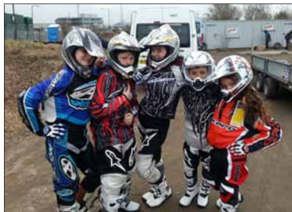
Haringey Group motor cycle project

The Haringey Group got off to a slow start, but is progressing well. The mixed group of boys and girls have been participating in a range of activities from arts and craft, sports, cooking, boxing, etc. The lead youth worker has established a good working partnership with Haringey Youth Service and they have a lot of exciting projects in the pipeline for the group in the near future.