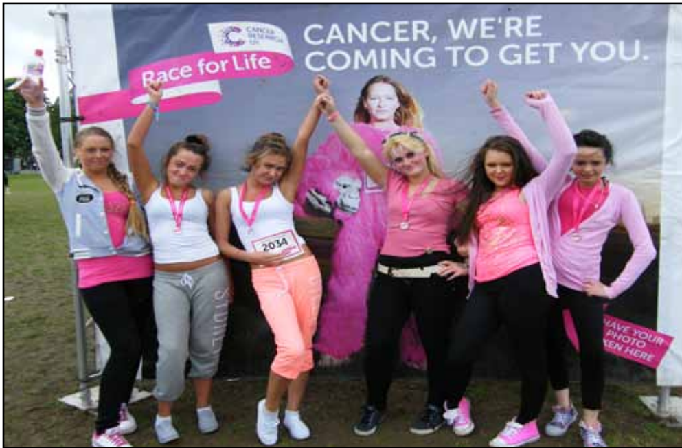
Hackney Girls Group 'Race for Life' in Finsbury Park

time or another, so they chose to use some of the money to register to take part in a 5k run to raise funds for cancer research. In Finsbury Park on the 22nd June, six girls completed the 5k 'Race for Life' and raised £375 pounds. The first girl finished in 50 minutes and the last in 1hr 20mins. The girls were all pleased with the achievement and vowed to do the 10k run next year for this valuable and much needed research.