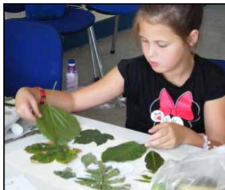
Youth Summer Programme