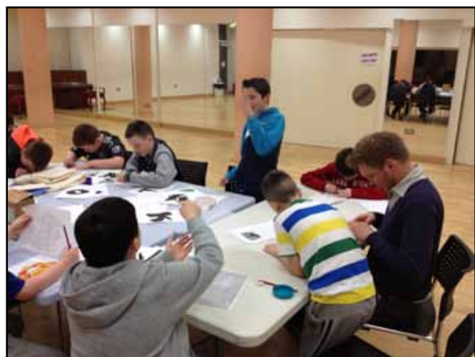
Hackney Boys Group working on banner for GRTM

The Haringey Group got off to a slow start, but is progressing well. The mixed group of boys and girls have been participating in a range of activities from arts and craft, sports, cooking, boxing, etc. The lead youth worker has established a good working partnership with Haringey Youth Service and they have a lot of exciting projects in the pipeline for the group in the near future.