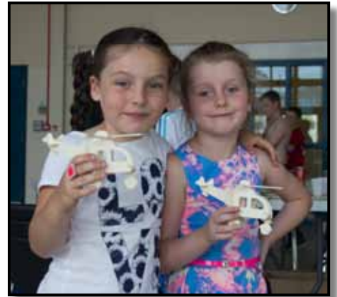
Youth Summer Programme

CEO until 31st July 2013 Joint CEO from 1st August 2013 Community Development Coordinator Joint CEO from 1st August 2013 Youth Coordinator Accommodation Advice Accommodation Advice Accommodation Advice Community Development Community Development Youth Youth until February 2013 Youth from March 2013 Youth from July 2013 Admin Resources Finance Planning Policy Media and Traveller Law Reform Project