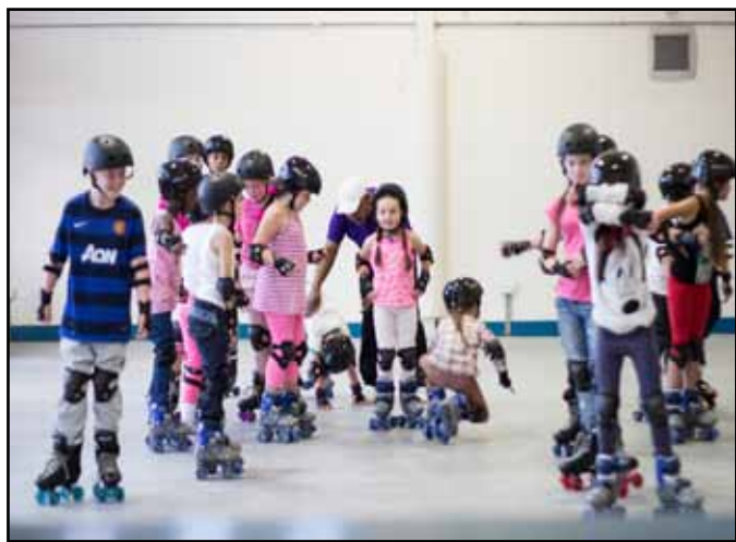
'Letsroll' getting ready for roller disco

In August we delivered another fun filled, two week summer programme. Over 50 young people attended and had a great time. Activities ranged from: cooking, wheelchair basketball, orienteering, arts & crafts, nature scavenger hunt, music workshop, where young people learnt to play instruments, t-shirt printing, and street dancing. One of the highlights of the summer programme was a day spent with 'LetsRoll', an organisation that provides taster roller skating sessions. The day entailed teaching the young people how to skate and then ended in a roller disco where they took part in a range of fun games. We were proud of the willpower of the young people who were determined to learn to skate at all costs. Thankfully the session ended without any broken bones - a day truly to be remembered!