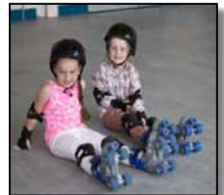
Youth Summer Programme