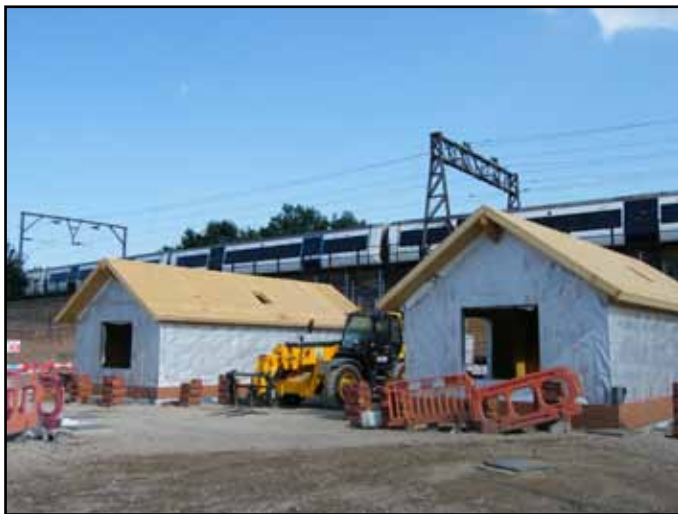
Site construction underway

It has been a very stressful year for the residents of Eleanor Street site. The construction phase of their new site is now underway after months of delay, the first 8 plots will now move in January 2014 with the remaining families moving later on in the year.