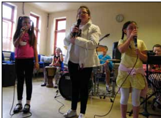
Music Workshop - Youth Summer Programme