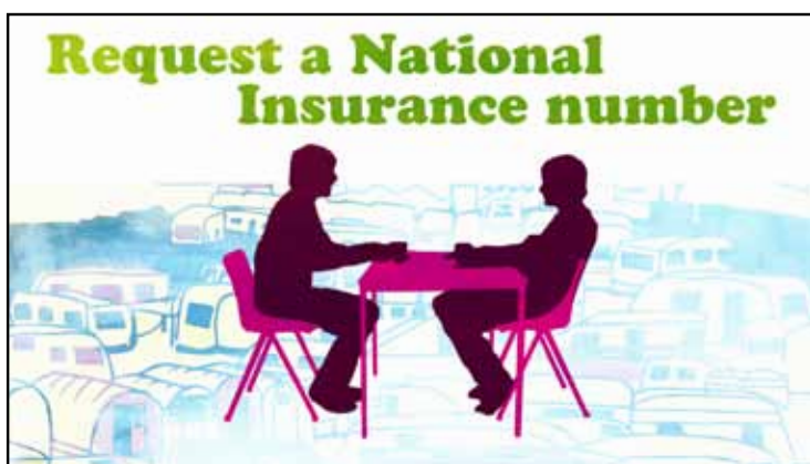
Still from 'How to become Self Employed'

This has been very well received by Gypsies and Travellers and has circulated in local and national networks. Aware of the complexities of individual cases, we are also running weekly advice sessions every Wednesday, where we assist individuals and couples to go through the necessary steps, including registering as Sole Traders, developing interview skills, and dealing with tax returns.