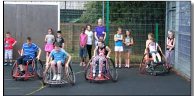
Wheelchair basketball - Youth Summer Programme