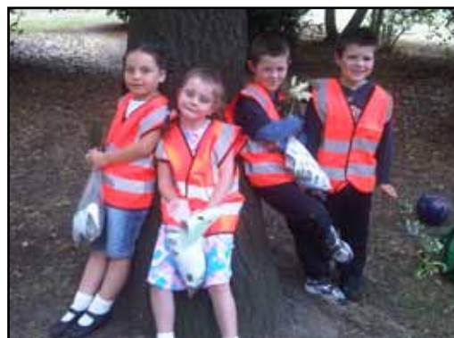
Scavenger hunt in Victoria Park - Our Youth Work Summer Programme