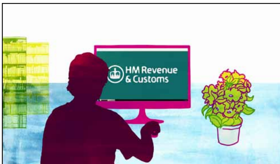
Still from 'How to become Self Employed'

We are seeing families taking this exciting but scary step into self-employment with determination to overcome some of the obstacles and becoming role models for others who we hope will follow.