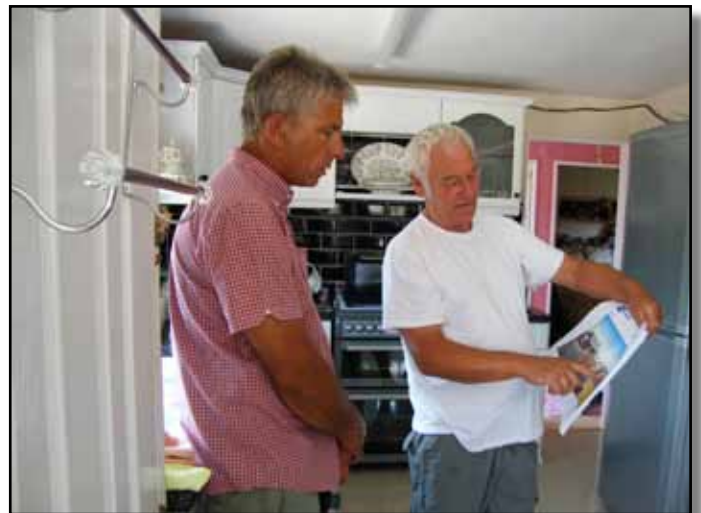
Consultation on the move

We have continued to support residents with their representation on all aspects of the move. Noise and dust levels have been a big issue for families this year because they have been surrounded by building works, with the new site construction on one side of their homes, and 24 hour a day working on the Crossrail shaft on the other side. Residents successfully negotiated with Crossrail, reaching agreement on compensation for living next to the 24 hour working. This payment will enable families to take some respite from the building works.