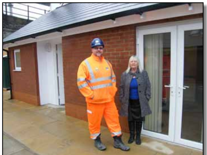
Visit to the first completed pitches

We very much hope that 2014 will see the end to the 10 year long struggle by residents' to secure the successful relocation of their site which will be called Old Willow Close.