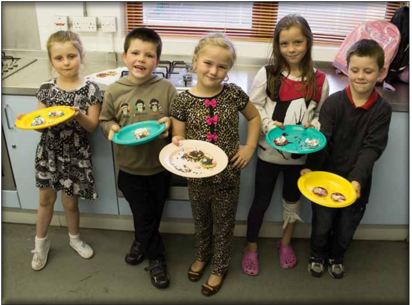
Baking Workshop - Youth Summer Programme