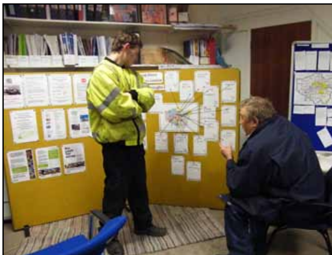
Scrap Metal - evidence gathering

self employment advice sessions. We are gathering evidence on the impact of this new law, through individual case studies along with researching and recording the response from councils. This