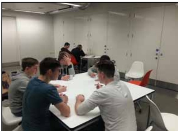
Young Men's Training

day: from catering to photography, DJ'ing to videography. The young men did their research to find out a breakdown of all the costs involved, which enthused the group into finding out what it would take to get more involved in this as a career alternative. They had some photography and DJ tuition that really fired their imagination. During the latter part of the year, the group expanded, therefore altering the dynamics, so we have worked on team building, effective communication and preparing the young men for our prospective construction taster sessions that we plan to start early in the new year.