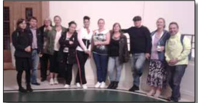
Hackney Travellers representatives attending the Scrutiny Commission at Hackney Town Hall

In Hackney, there has been active Traveller involvement in continuing to put pressure on the council to identify land for a new site by attending and speaking at the council's scrutiny commission meeting in October. We also supported Traveller representation at two meetings with the lead cabinet member and senior director to discuss our specific proposals on land for a site. We aim to support Traveller involvement in other borough consultations on their local plans and representation at the EIP's (Examinations in public) where possible.