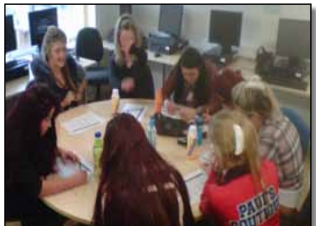
Young Women's Training

The young women worked very hard throughout the year preparing for their City and Guilds Adult Literacy and Numeracy exams. They remained focused the whole time and as a result two women passed literacy, highest mark 77.5%, and two passed numeracy, highest result 82.5%. The young women did not think that it was possible to gain a qualification and are over the moon with their achievements. Now that they know that they are more than capable they are keen to progress to the next stage.