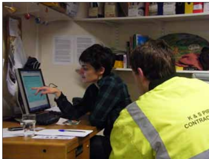
Scrap Metal - applying for a license

will inform a community led campaign in the new year, where we seek to challenge the lack of consultation and ask for an amendment to the law which will more be workable and affordable for both scrap collectors and councils.