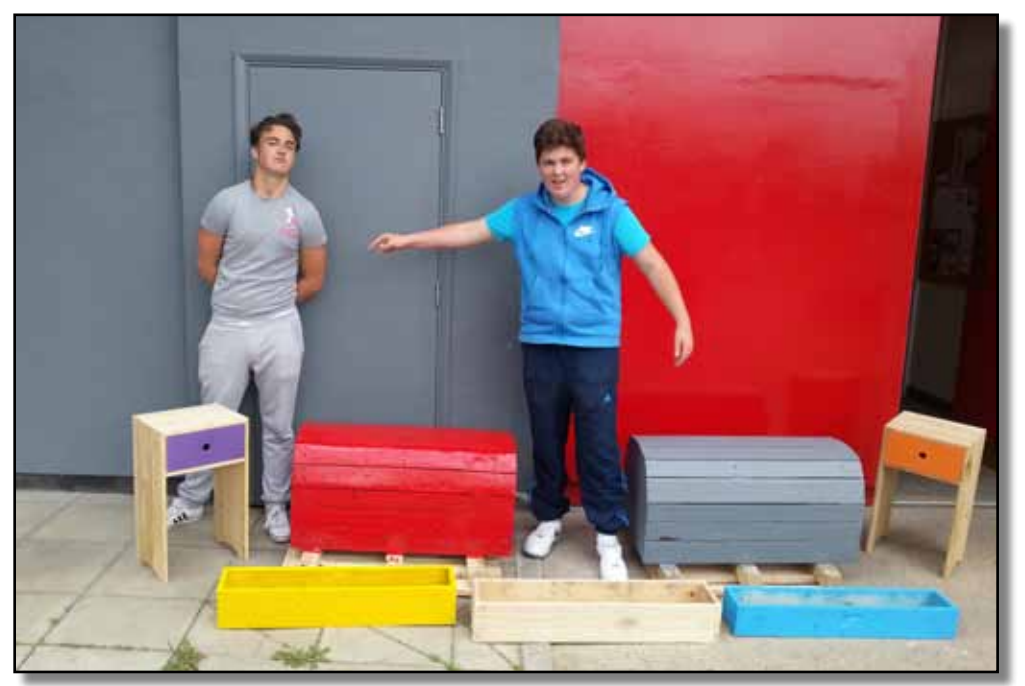
Young Men'sTraining 8

The young men completed an 'upcycling' course in partnership with Action Dog and Peabody Housing Trust. They made bedside cabinets out of recycled materials which were then displayed at Hotelympia 2014, exhibition at Excel London. The young men also gained an ASDEN accreditation in youth activity certificate.