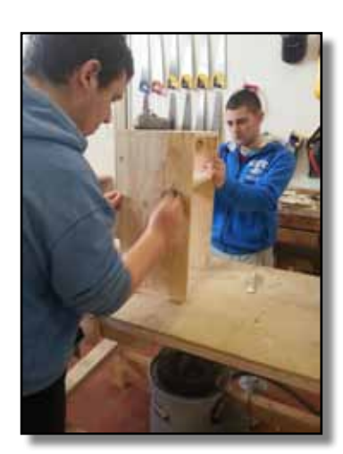
Young men's up-cycling course