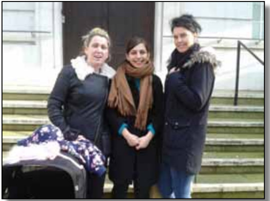
Representation at Hackney's EiP

At local level, we have been significantly involved in a number of borough local plans and Gypsy and Traveller Accommodation