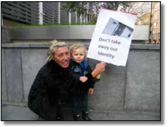
Demonstration outside the DCLG