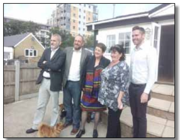
London Assembly housing committee Site visit to Bridale Close in Southwark

One of the main objectives of the Forum's work this year was to feed in the London Assembly Housing Committee investigation into Gypsy and Traveller accommodation needs and site provision. The Forum