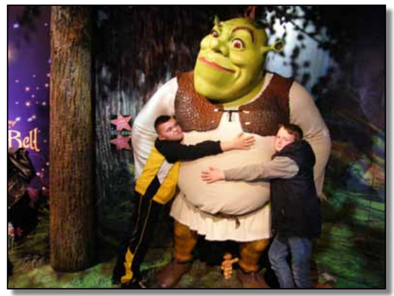
Haringey Group visit to Madam Taussauds

The Haringey Group is a mixed group of boys and girls. The priority this year has been to consolidate the youth work in Haringey by building stronger partnerships, widening contact with Traveller families and raising young peoples awareness of services that exist in the borough. The group focused on building a 3D site model in order to explore their cultural heritage in creative way. This idea of replicating real life objects that are central to their lives provides an exciting and stimulating challenge. The project also gave a chance to the group to participate in kite making and flying which is a wonderful sport and one that captured and held the young peoples attention throughout the sessions. They also took part in the Music Project which was a joint venture