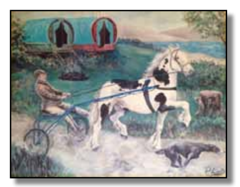
Camden Travellers Association logo

This year, Traveller representatives in Camden made significant strides forward through the setting up the new Camden Travellers Association. The idea came together after a series of frustrating meetings with Camden council officers, where little progress was being made in addressing their long standing concerns. They decided to set up the group in order to change the dynamic of the meetings and take more control over the agenda, enabling Camden Travellers to more effectively hold the council to account on their commitments. We are committed to continuing to support the Camden Travellers Association over this coming year.