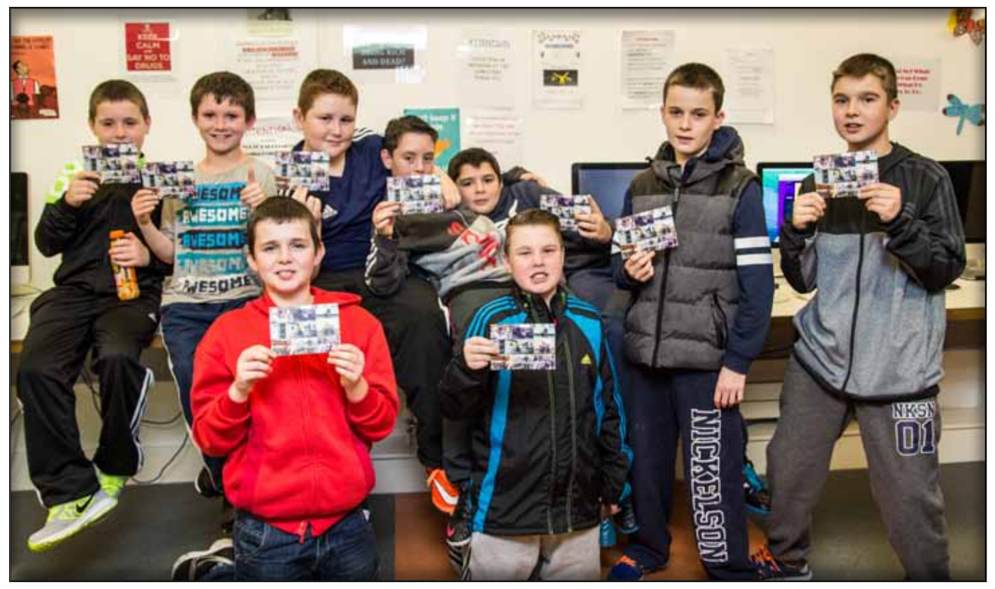
Hackney Boys - Photo Project