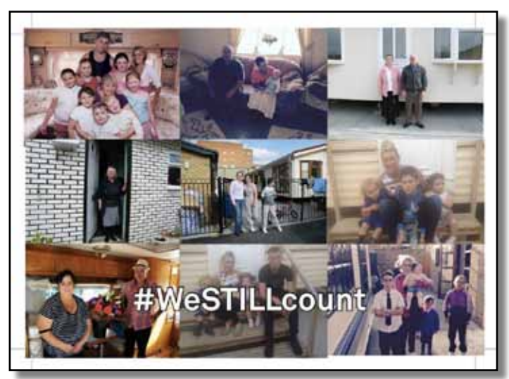
houses will no longer be included when councils assess the need for more pitches in their area. This will mean that the majority of Gypsies and Travellers will be excluded from accommodation needs assessments as councils will only have to include Traveller families who can prove they are travelling.

In September the Government produced a consultation on some disastrous changes to the definition of Gypsies and Travellers in planning law, which proposed that families who are settled on sites and in